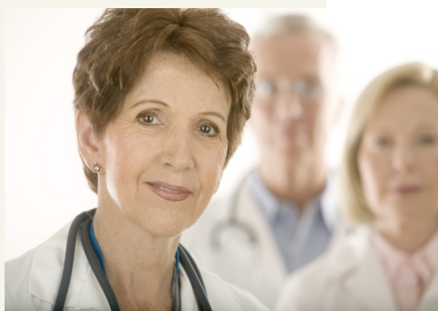
Networking for older people

A: Discuss care planning at the Practice Meeting. Refer appropriately for additional medical support. Refer to ICCS—who also have links with Social Services. Request feedback and monitor progress